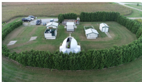
Prairie Grass Observatory at Camp Cullom

Observatory Information: 28" Starmaster telescope, 16" Newtonian reflector, 16" Meade LX200R telescope, 7" Meade ED APO refractor telescope, 100 mm binoculars on universal mount, warming room w/ DSL internet.