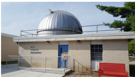
West Lafayette Observatory at Cumberland Elementary School 600 Cumberland Ave. West Lafayette, IN

Observatory Information: 16", 13", 10", and 8" diameter telescopes, Lunt LS60TH \alpha solar scope, and 8" binocular telescope.